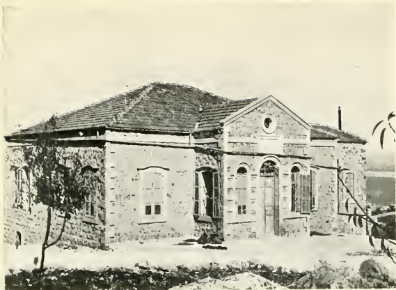
SOUTH FRONT OF THE MOZAFER KHANEH